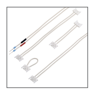
Flexi-Mate<sup>™</sup> 24 AWG Cable Assemblies