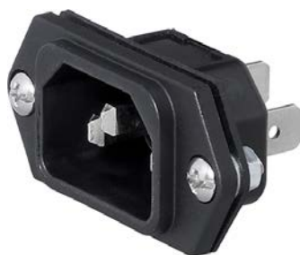
6100 with sealing to appliance