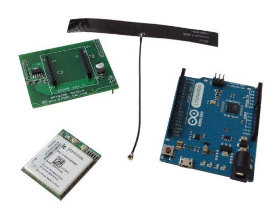
Complete System Setup

Development Kit - Software Examples (ZIP)